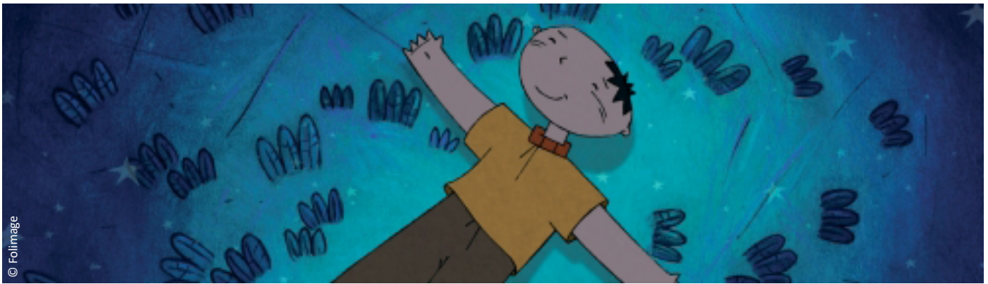
La Tête dans les étoiles by Sylvain Vincendeau