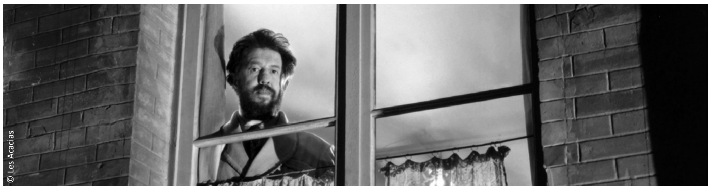
Panic by Julien Duvivier

A retrospective of 20 films combining classics and curiosities from all eras!