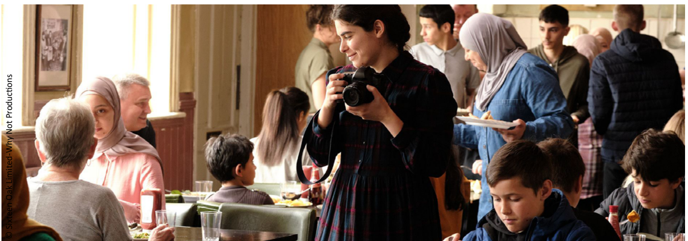
The Old Oak by Ken Loach