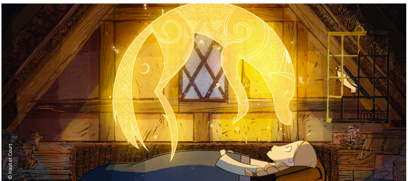
Wolfwalkers by Tomm Moore et Ross Stewart