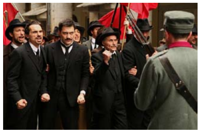
Vincere by Marco Bellochio