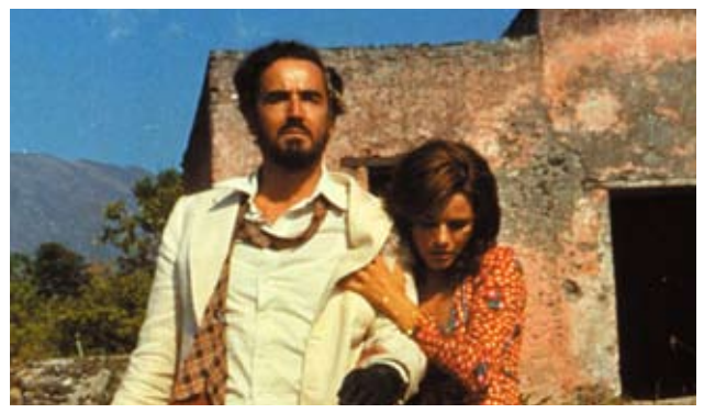
Scent of a Woman