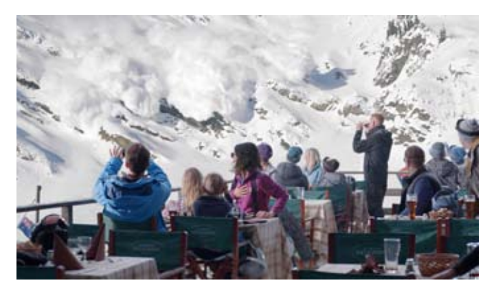
Snow Therapy by Ruben Östlund