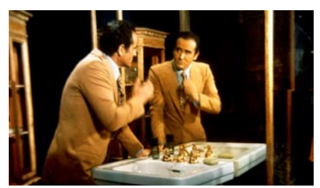
In the Name of the Italian People