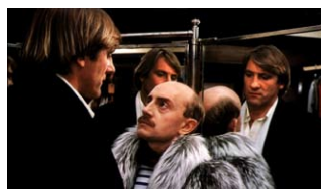
Tenue de soirée