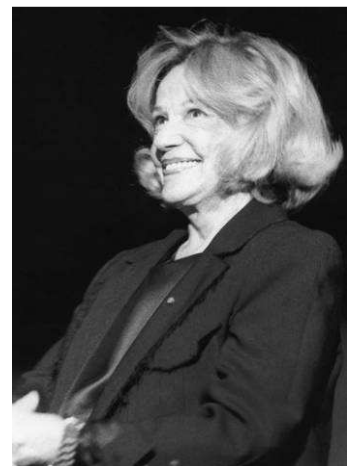
Jeanne MOREAU