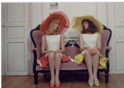
Les Demoiselles de Rochefort