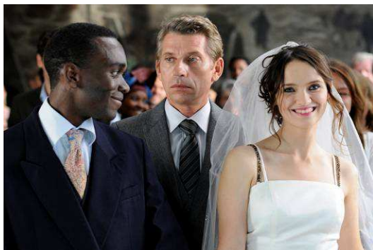
Le Nom des gens