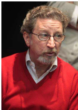
Robert GUEDIGUIAN