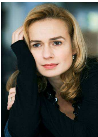
Sandrine BONNAIRE