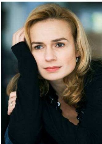
Sandrine BONNAIRE