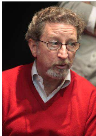
Robert GUEDIGUIAN