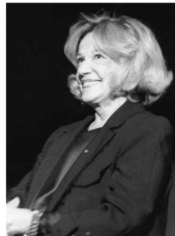
Jeanne MOREAU